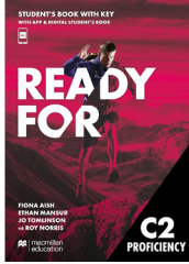
TABLE OF CONTENTS: READY FOR C2.2