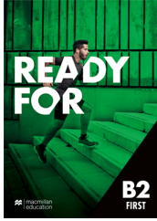
TABLE OF CONTENTS: READY FOR B2.1