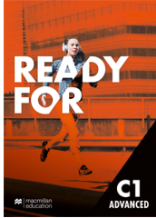
TABLE OF CONTENTS: READY FOR C1.2